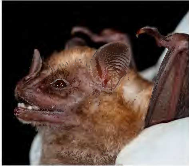
Figure 5. Photograph of a male Artibeus jamaicensis from swimming pool of the Kings Well Resort on the island of St. Eustatius. Note the large nose-leaf, white stripe over the eye, and brown coloration, all characteristic of this species.

Hispaniola, Puerto Rico, St. John, and Dominica (Genoways et al. 2001). P. Larsen et al. (2007) included 10 individuals of A. jamaicensis collected from St. Eustatius in their phylogenetic analysis of the Artibeus jamaicensis complex. Their results show a single mitochondrial cytochrome- b haplotype shared among the 10 individuals and this haplotype was also shared with individuals collected from a wide geographical distribution, ranging from Quintana Roo, Mexico, eastward to Jamaica and Puerto Rico, throughout the northern Lesser Antilles, and as far south as Carriacou in the Grenadines. The results of P. Larsen et al. (2007) support the hypothesis of a recent Caribbean colonization by A. jamaicensis (perhaps within the last ~25,000 years) originating from Central American populations and expanded rapidly to the east across the Greater Antilles and Lesser Antilles. Carstens et al. (2004) identified a similar lack of genetic variation across the northern Lesser Antilles; however, their analyses also identified three A. schwartzi mitochondrial haplotypes on the islands of Montserrat, Nevis, and St. Kitts (see P. Larsen et al. 2007 and P. Larsen et al. 2010). The existence of A. schwartzi mitochondrial haplotypes circulating in northern Lesser Antillean populations of A. jamaicensis provides evidence of historical or ongoing hybridization (P. Larsen et al. 2010). Moreover, this observation suggests gene-flow from southern